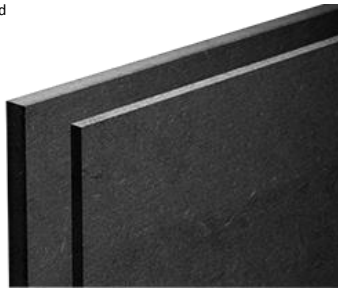
Fine machining possible (delicate cutting patterns) due to the extreme compactness of the material.