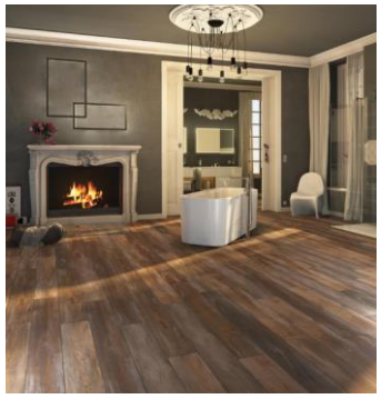
Camelot Oak (P 1201) from the AQUA ROBUSTO collection