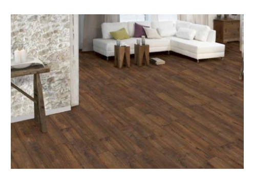
Meadow Teak (VB1206) from the COUNTRY collection

The licensing partnership between Villeroy & Boch and SWISS KRONO Group has been in place since 2014. With the current flooring line, Villeroy & Boch is integrating more high-quality laminate flooring into its new home environment collection.