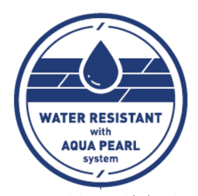
WATER-RESISTANT with the AQUA PEARL seal, used by all SWISS KRONO sites

The products are offered at the various sites under their own names. The corresponding collection from Germany is called AQUA ROBUSTO, while the one from Poland is called AQUA ZERO. The Swiss site is also presenting its water-resistant laminate flooring at BAU 2019 under the name "AQUASTOP".