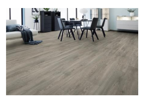
Bradford Oak (VB 1008) from the CONTEMPORARY collection