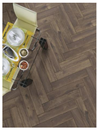
Calais Oak (D 4766) from the HERRINGBONE collection

With HERRINGBONE, SWISS KRONO TEX has developed a new presentation and installation method for adept do-it-yourself application. The easy-to-handle, two-piece set makes installing an elaborate-looking floor covering simple, as does the modern CLIC system.