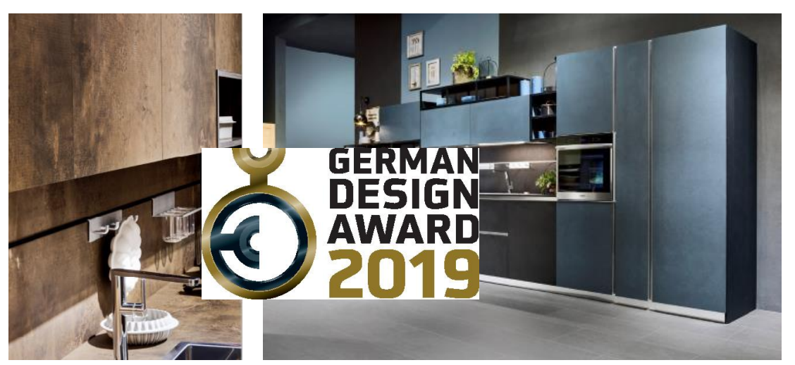
SATURN (D 4210 TX) from the FANTASY collection and BLUE (D 4217 TX) from the METALLIZED collection

CamuStyle<sup>TX</sup> was awarded the prestigious German Design Award 2019 in the category "Excellent Product Design – Material and Surfaces." The judges agreed that: "The particular Brutalist esthetic of the surfaces gives furniture and rooms a unique effect and an elegant vibrancy. A fantastic material with striking surface structures, which are also tactile, providing inspiration and stimulating creativity."