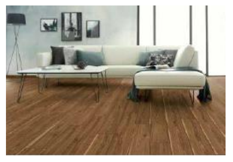
Dublin Walnut (VB 829 V) from the COSMOPOLITAN collection