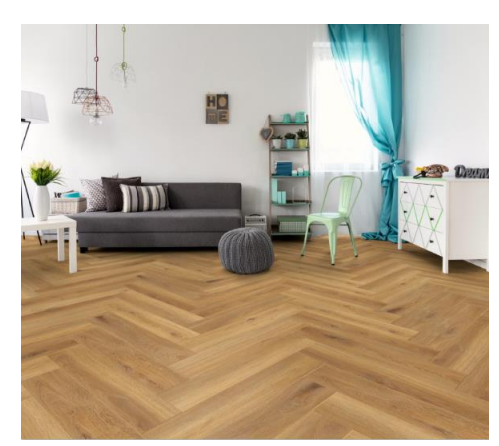
Pisa Oak (D 3861) from the HERRINGBONE collection