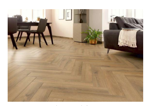
Harmony Oak (VB 805) from the HERITAGE collection