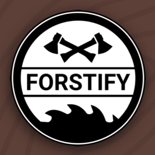
Forstify GmbH Founded in 2018 www.forstify.de